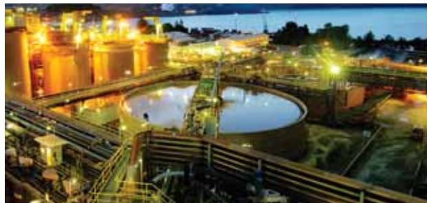
Lihir Gold Mine, Papua New Guinea, 2007: Versatility made Interzone 954 one of the key products chosen for this major project.